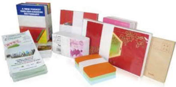
RETAILS (FLYERS & BOOKS)