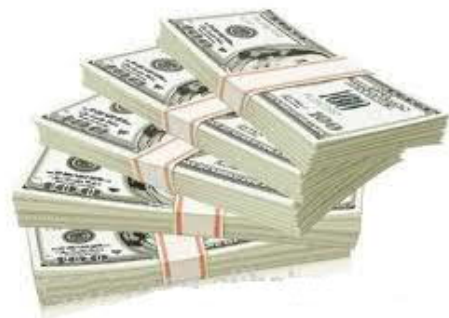
BANKS & POSTOFFICES (BANKNOTES)